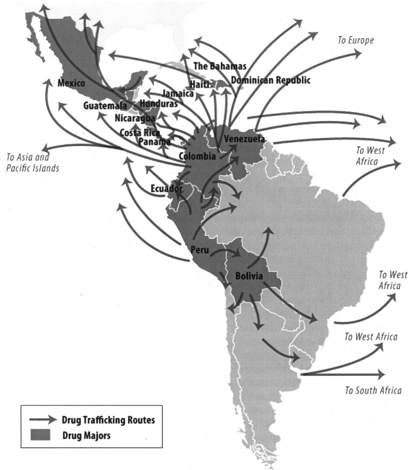
Figure 1: Source, Congressional Research Service

As demonstrated by the extensive connectivity among the producing and transit regions, the concept of initiating a productive Caribbean Basin security initiative without having some strategy for closing the main door through which the drugs enter the region (Venezuela), is likely to be untenable. While the Caribbean is also a transit zone for cocaine leaving Colombia, there is a fundamental difference. The Colombia Government, at great cost in life and national treasure, actively works to combat the trafficking and to drive it from its national territory.